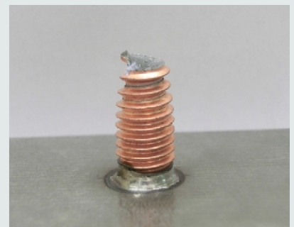
b) M12 抗拉力测试, 螺柱断裂 Tensile test. Weld stud fracture.