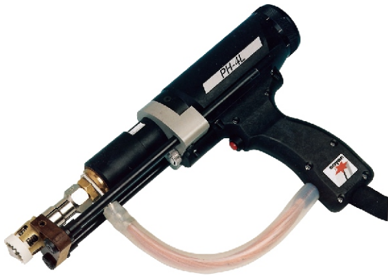
PH-4L螺柱焊枪 PH-4L stud welding gun